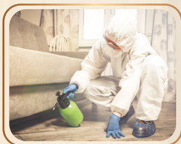
Anti Termite Treatment