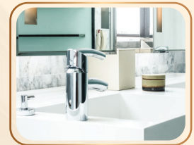
Premium Bathroom Fittings