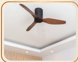
Fans & Lights