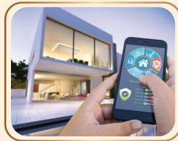
Smart Home Automation