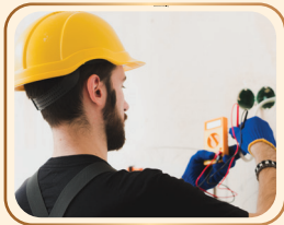
1st Year Free Maintenance