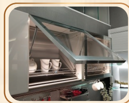
Aluminium Safety Shield for Wardrobes & Kitchen