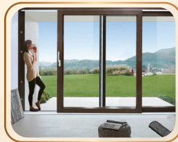
UPVC Doors & Windows