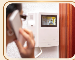
Video Door Phone