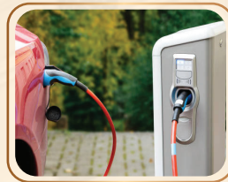
Electric Vehicle Charging Point